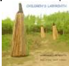
2010 CHILDREN'S LABYRINTH