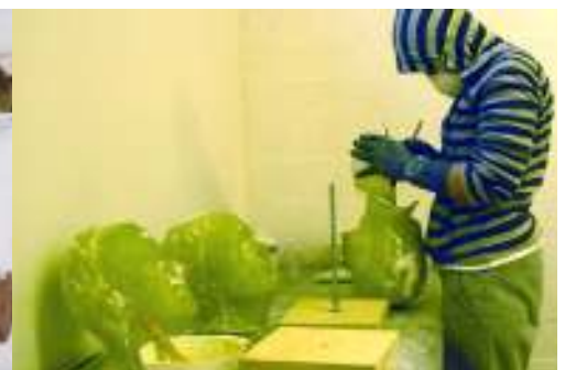
children participating in LABYRINTH symposium -local community involved by artists in XROADS – artist at work at LABYRINTH installation