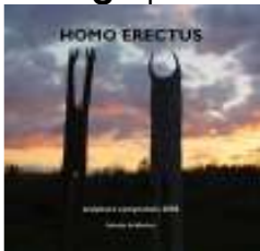
2006 HOMO ERECTUS