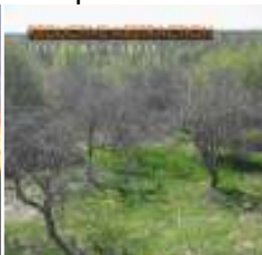
2005 LESS IS MORE AGAIN