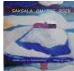
SAKSALA ON THE ROCK